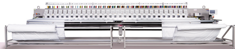
▲ model: E-WB(X)630-68