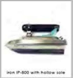
Iron IP-800 with hollow sole