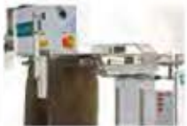
trouser topper waistband clamp