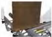
trouser topper inside clamp