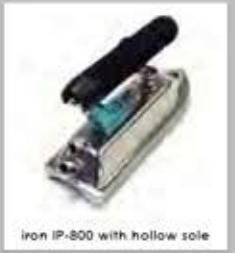
Iron IP-800 with hollow sole